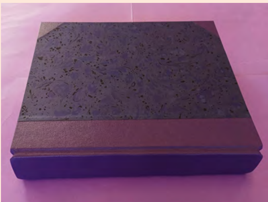
Book fully covered with book-cloth & marbled papers (spine view)