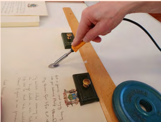
Making single sheets into sections with conservation grade tissue and spatula

The volumes were displayed for the King's Coronation in May.