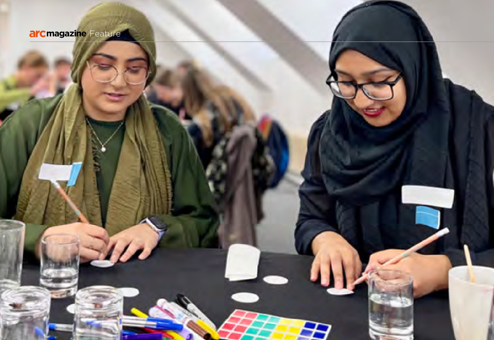
Young Participants at the Young People’s Showcase, Birmingham, October 2022