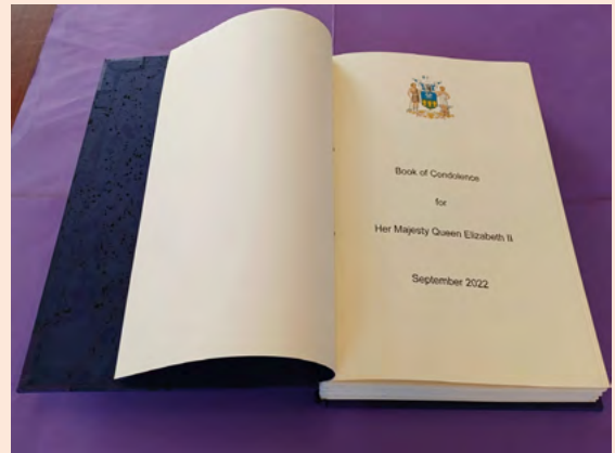
Book open at title page