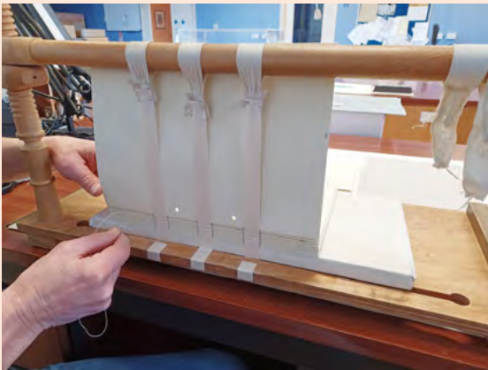
Sewing up sections on sewing frame