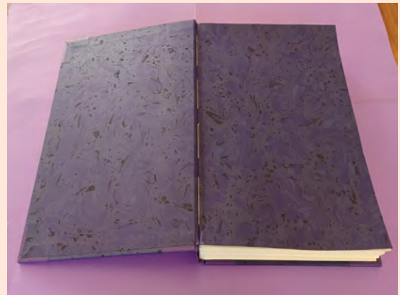
Book open at front showing marbled endpapers