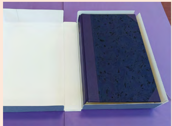
Book in bespoke archival box