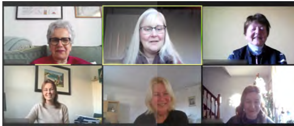
Digital Dig online volunteers

gone far beyond our expectations and we are so grateful for their incredible contribution. The resulting work is testament to the number of hours that the volunteers have spent transcribing and geotagging the nursery catalogues. The films produced by the Digital Ambassadors are also a wonderful showcase of how the project captured the imaginations of the young people involved.