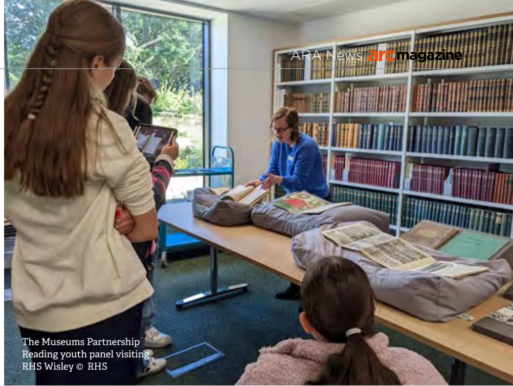
The Museums Partnership Reading youth panel visiting RHS Wisley